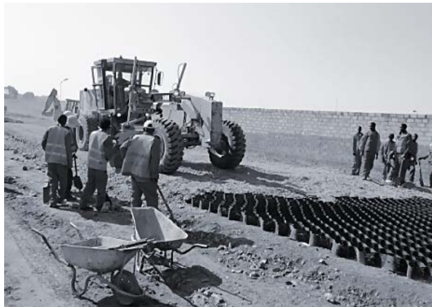
Urban Roads Upgrade, Lot 9, Matero. Layerworks, Ancillary Works and Surfacing of Urban Roads in Matero Township, Lusaka