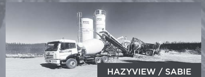
HAZYVIEW / SABIE