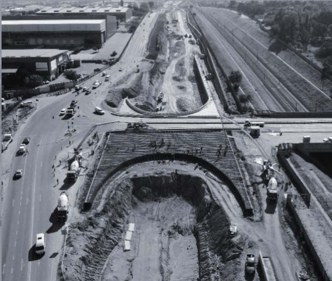
K101 / OLD PRETORIA ROAD Upgrading of the K101 Old Pretoria Road.