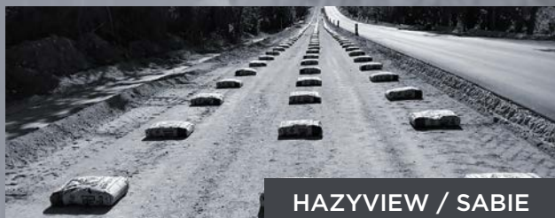
HAZYVIEW / SABIE