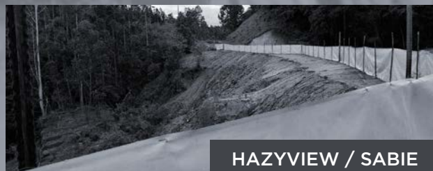
HAZYVIEW / SABIE